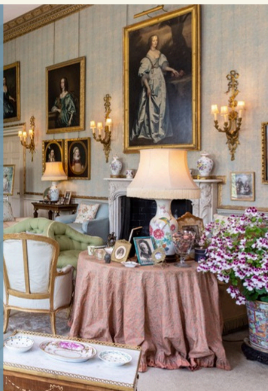
The Drawing Room

"A wonderful eclectic mix of architectural styles."