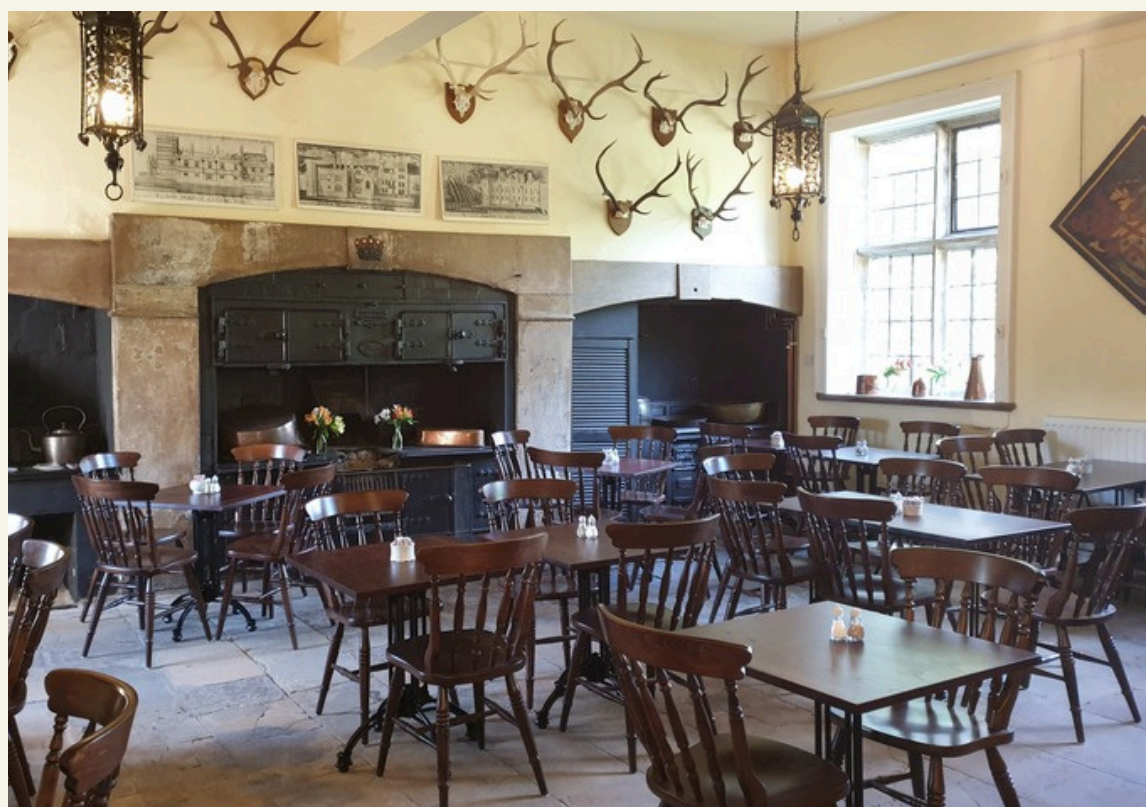
The Old Kitchen Tea Room

Set in what was the Old Kitchen for the main house, our delightful tea room can offer a range of pre-booked refreshments, from tea, coffee and cake, to light lunches, sandwiches and soups. All food freshly prepared by the families Cook so we kindly ask that one option is chosen for the entire group.