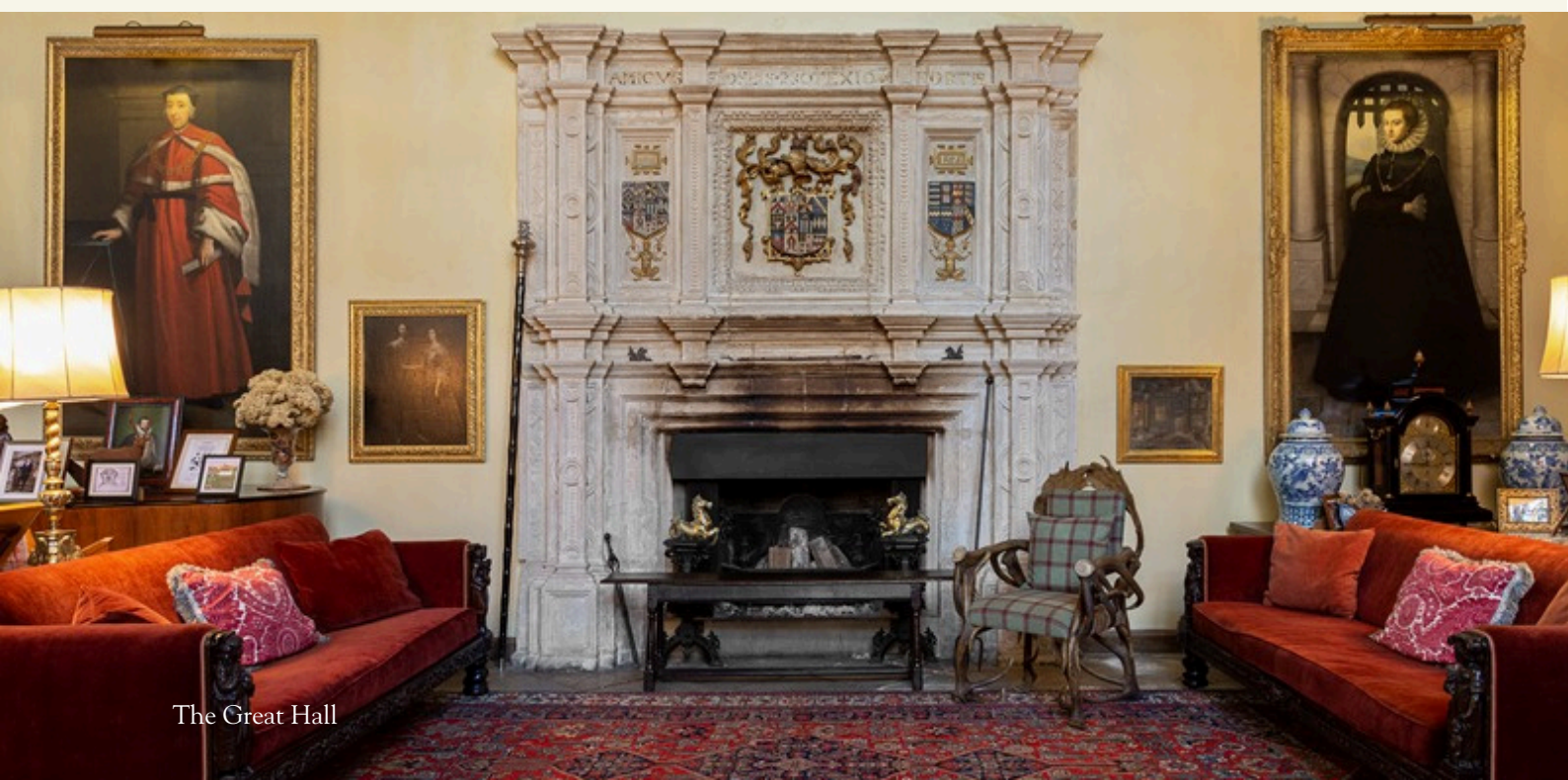
The Great Hall

Please be aware that our food may contain or come into contact with common allergens, such as dairy, eggs, wheat, soybeans, tree nuts, peanuts, fish, shellfish, or wheat. While we take steps to minimize risk and safely handle the foods that contain potential allergens, please be advised that cross-contamination may occur, as factors beyond our reasonable control may alter the formulations of the food we serve, or manufacturers may change their formulations without our knowledge.